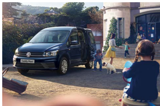
Image shown is for illustrative purposes only. Vehicle shown is not UK specification.

These words have the following meaning throughout this policy, where highlighted bold: