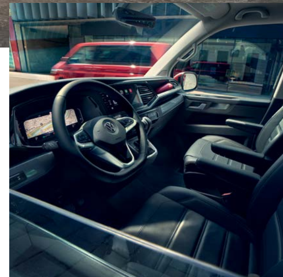
Interior shown is Caravelle Executive